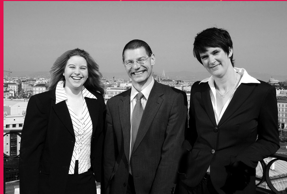
The ARQA-VET Team

Austrian Reference Point for Quality Assurance in Vocational Education and Training at the Austrian Exchange Service (ÖAD)